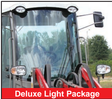
Deluxe Light Package