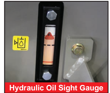
Hydraulic Oil Sight Gauge