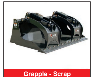
Grapple - Scrap