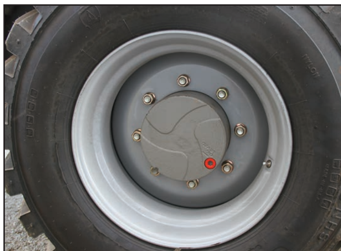
Outboard Planetary Drives