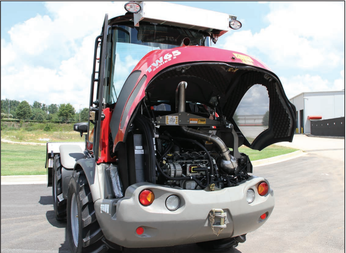
Large lockable rear service hood provide outstanding service and maintenance access.

standard hydraulic coupler simplifies attachment exchanges. The operator's station is elevated and unobstructed for greater visibility and job site awareness. Excellent power and precise control result in increased productivity, and with lower operational and maintenance costs the TW65 Series 2 is a great alternative to the skid steer loader.