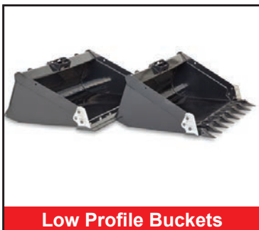
Low Profile Buckets