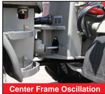
Center Frame Oscillation